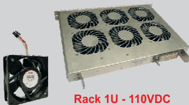
Rack 1U - 110VDC